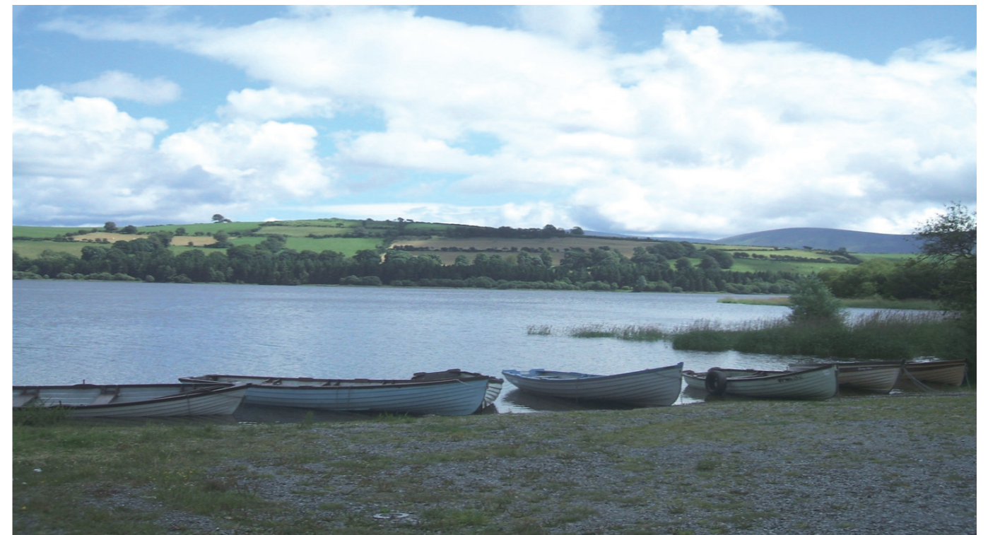
Kildare County Council National Roads Design Office